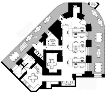
LAYOUT - HUBFLOW MAX