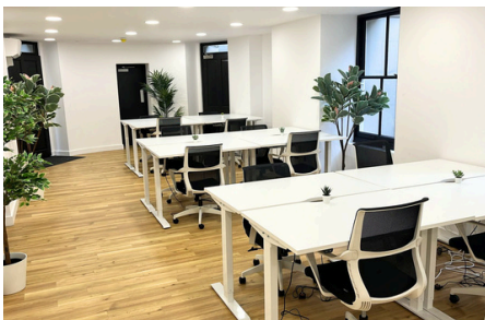
HUBFLOW WHITE LABEL