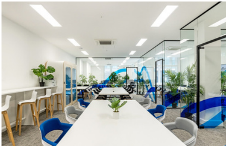
HUBFLOW WHITE LABEL